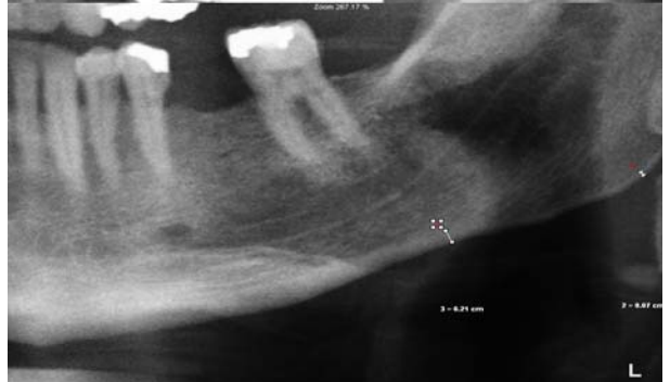
B: Normal individual