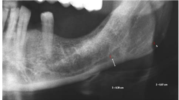
Figure 1. The Cortex thickness of the lower border of mandible, A: Individual with lowered BMD, B: A Normal individual.

The correlation coefficient of the mandibular cortex angle thickness on the left and right sides was 0.820 and that was significant (P<0.0001). Patients with a mandibular cortex thickness of less than 3 mm were sent