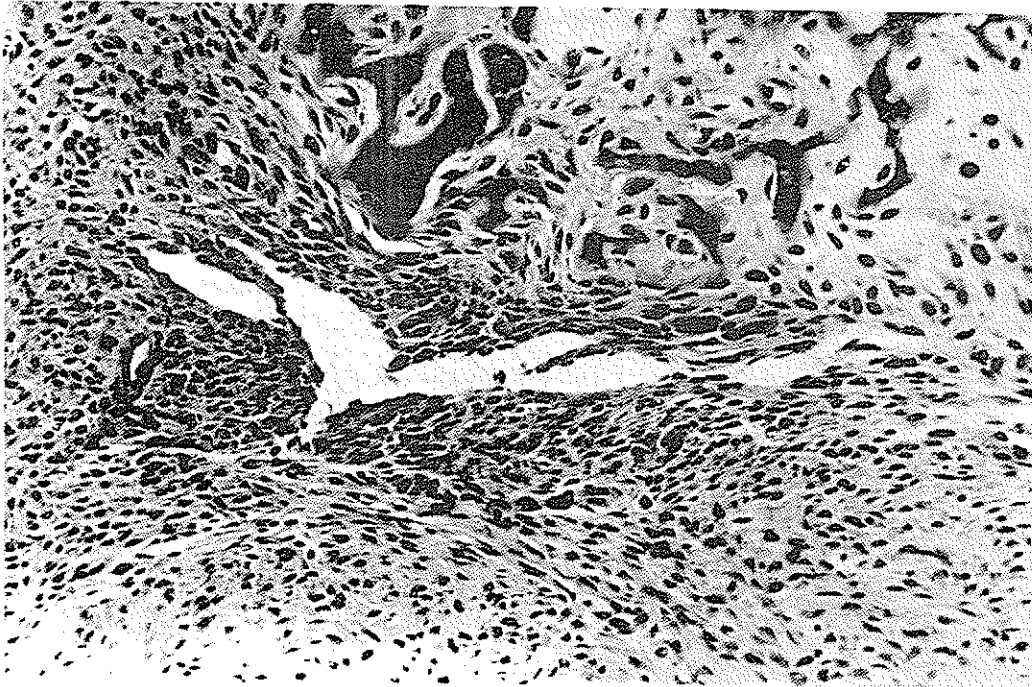
Fig. 3. Sarcomatous tissue produced bony trabeculae.