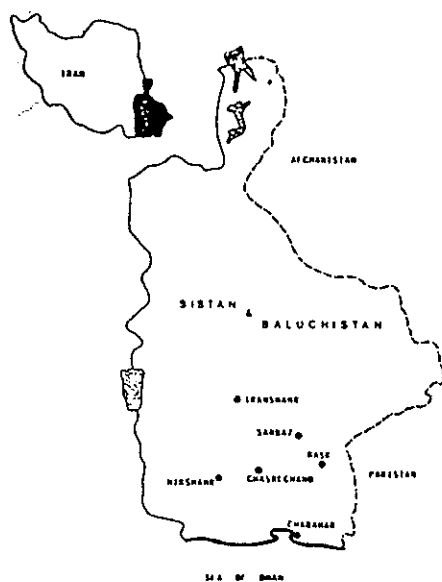
Fig. 1. Map of the study area in the province of Sistan and Baluchistan, Iran, 1997 (after Zaim and Javaherian, 1991)(4)