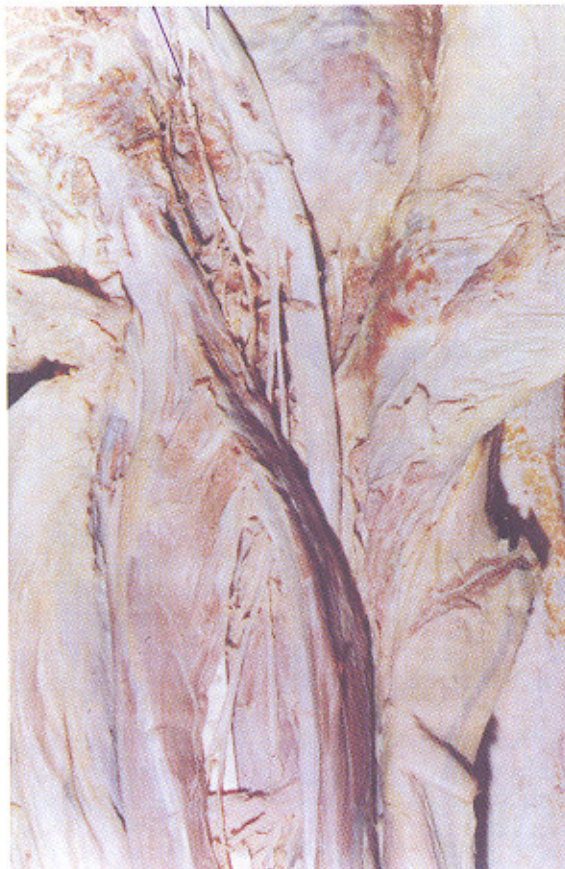
Fig. 1. Primary divisions of sciatic nerve in hamstring muscles

branches are sent to the proximal part of ST and the long head of BF which in the case of branch to ST, just in 1% of cases a common trunk was seen though this percent was 72% for BF branch.