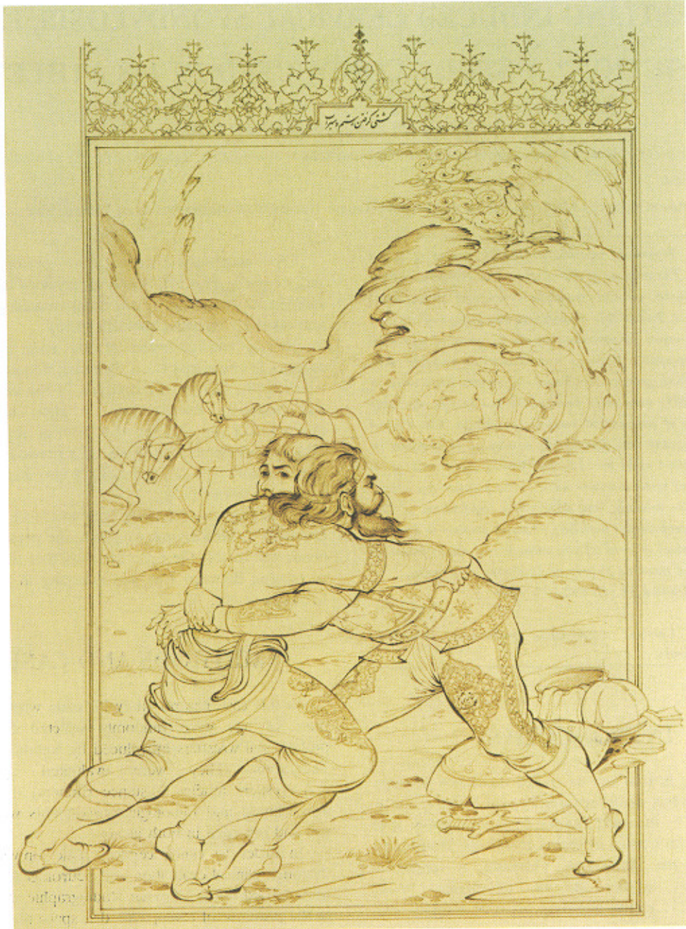
Fig. 1. Wrestling between Rostam and Sohrab, the two legendary wrestlers in ancient persia.