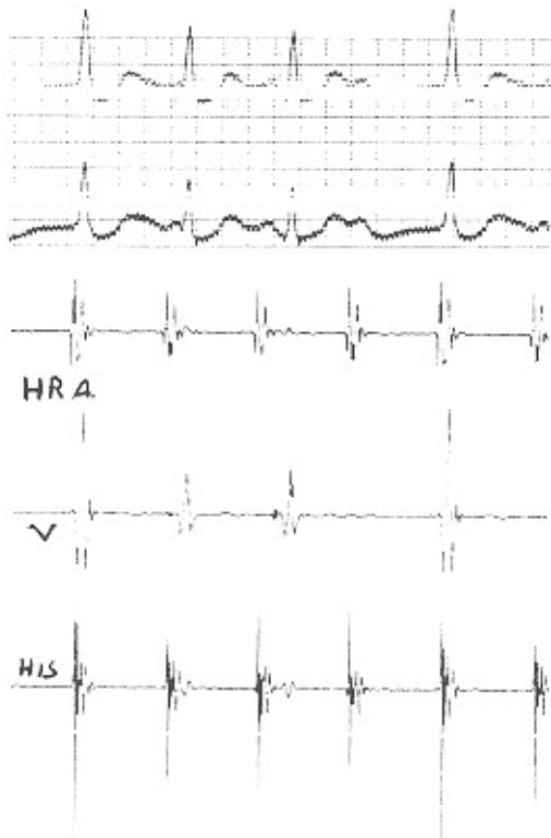
Fig. 1. Wenckebach periodicity during AVNRT