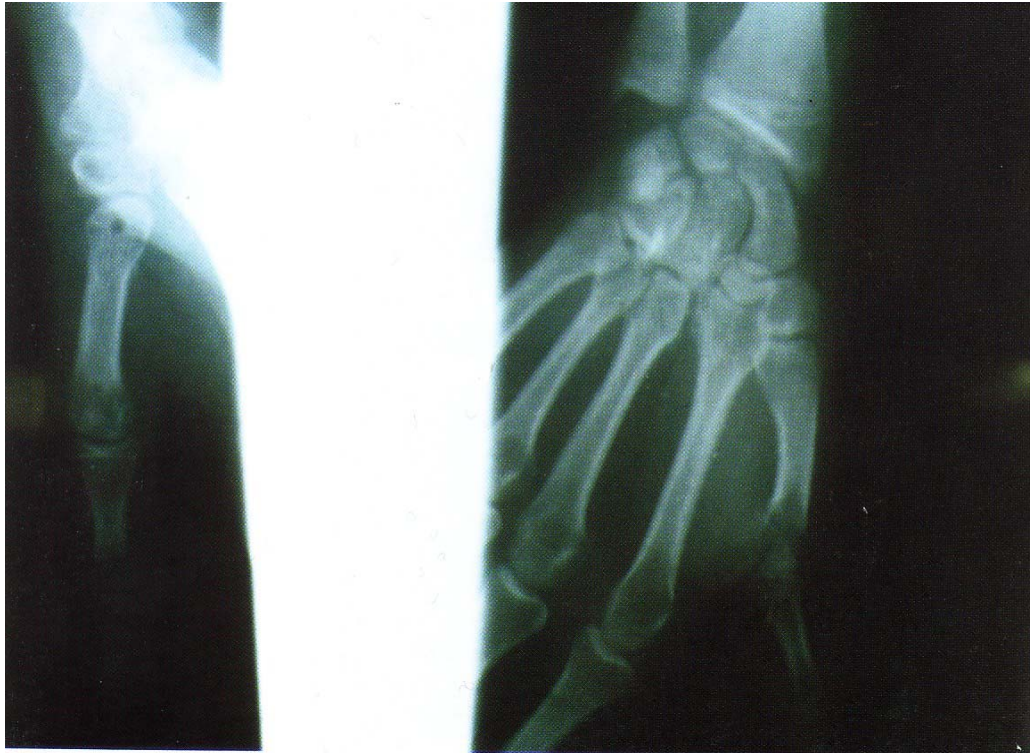
Fig. 3. PA and Lateral views 4 months after operation. Arrow shows the hole for passage of radial split of flexor carpi radialis tendon.