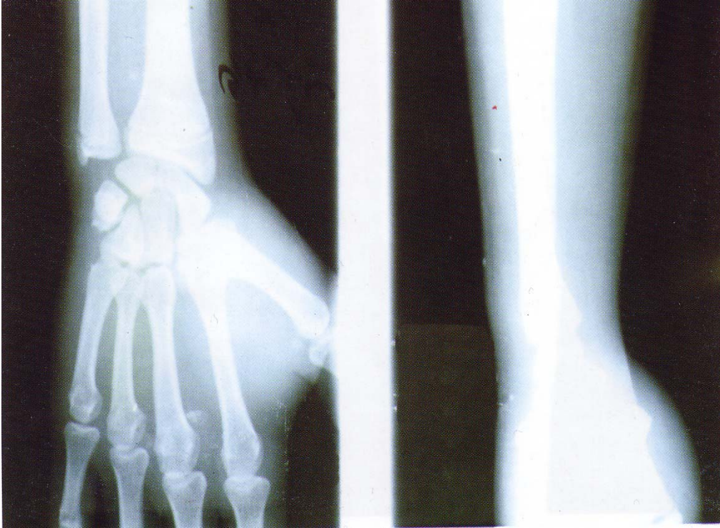
Fig. 1. PA and Lateral view of right hand 3 months after injury. Volar dislocation of first CMC joint is evident