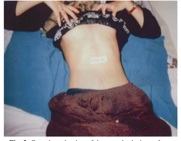
Fig. 3. Complete clearing of the pustular lesions after 10 days.