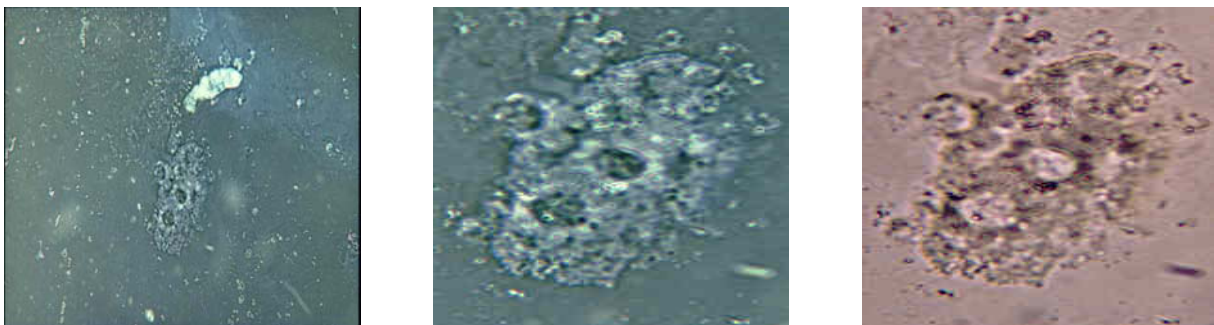
Fig. 2. Interaction pattern of hemocytes with Schistosoma mansoni miracidium: inverted microscope picture of engulfing (Fig.2.A-B); Light microscope picture of engulfing (Fig. 2.C).