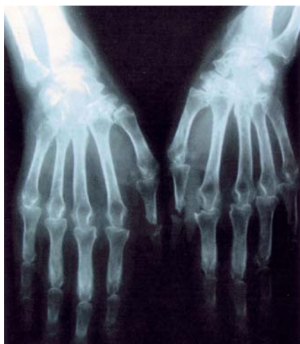
Fig. 3. Bilaterally symmetrical erosions of the wrist and hand joints.

The polyarthritis is usually diffuse, symmetric, progressive and destructive with predilection for distal interphalangeal joints (2). The disease is rare and fewer than 200 cases have been reported in medical literature (5). To the best of our knowledge this is the second case report of MRH from Iran (6).