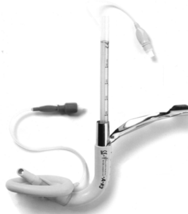
Fig. 3. Intubating Laryngeal Mask Airway showing an ETT inserted through a metal stem of ILMA.

After four months, in another session of right auriculoplasty and framework insertion reconstructive surgery under general anesthesia, because the patient was unwilling to undergo awake intubation, he was planned for intubation of trachea through the ILMA, after induction of anesthesia. He was premedicated and anesthetized as before and patency of the airway was attained. After achieving sufficient jaw relaxation, a size 4 ILMA (ILMA; LMA-Fastrach™, Laryngeal Mask Company, Ltd., Henley on Thames, UK) (Fig. 3) passed with ease. An airtight seal was achieved by inflating the cuff with 30 mL air. The trachea was intubated with a size 7.5-mm internal diameter (ID) silicone-cuffed tracheal tube that was passed through the ILMA (Fig. 4). Correct placement of the tracheal tube was confirmed by auscultation of the chest. The ILMA was removed over the tube. The remainder of the anesthesia management was uneventful.