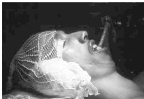
Fig. 4. The trachea was intubated with a size 7.5 mm (ID) silicone-cuffed tracheal tube that was passed through a size 4 ILMA.

After four months, in another session of right auriculoplasty and framework insertion reconstructive surgery under general anesthesia, because the patient was unwilling to undergo awake intubation, he was planned for intubation of trachea through the ILMA, after induction of anesthesia. He was premedicated and anesthetized as before and patency of the airway was attained. After achieving sufficient jaw relaxation, a size 4 ILMA (ILMA; LMA-Fastrach™, Laryngeal Mask Company, Ltd., Henley on Thames, UK) (Fig. 3) passed with ease. An airtight seal was achieved by inflating the cuff with 30 mL air. The trachea was intubated with a size 7.5-mm internal diameter (ID) silicone-cuffed tracheal tube that was passed through the ILMA (Fig. 4). Correct placement of the tracheal tube was confirmed by auscultation of the chest. The ILMA was removed over the tube. The remainder of the anesthesia management was uneventful.