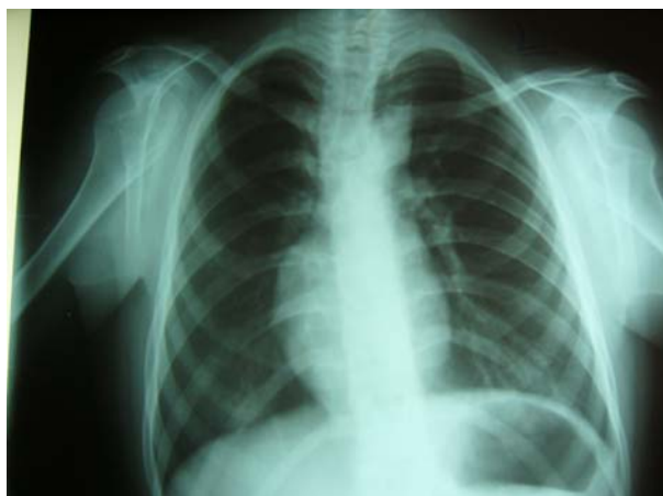
Fig. 2. Shoulders dislocation.