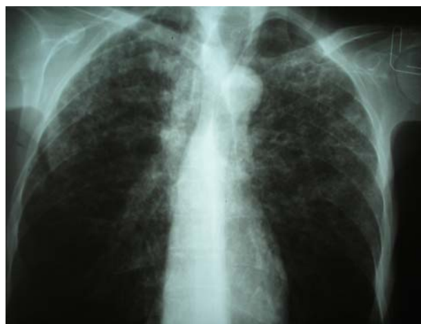
Fig. 2. Apical pulmonary involvement.

We obtained informed consent to publish details of the patient's history.