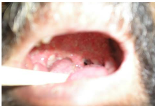
Fig 1. Oral and oropharyngeal tuberculosis.

In physical examination, multiple erythematous and irregularly ulcerative lesions affecting soft palate area, uvula and anterior tonsillar pillar was noted bilaterally (Fig 1).