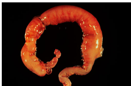
Figure 1. Patient with total colon Agangelionosis

From primarily operated pts, 6 were under one year of age, the other 3 pts were 2,3 and 5 years old at the time of pull-through. The PT with TIA had no pull-through operation but laparotomy and staged biopsies.