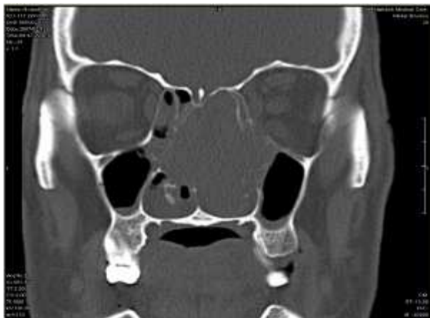
Figure 2. Pathologic finding revealing metastatic clear cell carcinoma in to the nasal wall.

Patient refused more treatment (radiotherapy or chemotherapy and or immunotherapy). Pathologic examination confirmed the diagnosis metastatic renal cell carcinoma since it histologically was similar to the renal cell carcinoma which was previously resected (Figure 2). He achieved a complete clinical response without any significant complication and recurrence of the tumor after 1 year follow up using with interanasal endoscopic examination and study in other organs for metastasis (brain, paranasal, chest and abdominal CT with contrast and bone scan).Nasal biopsy performed 1 year after treatment was negative for malignancy.