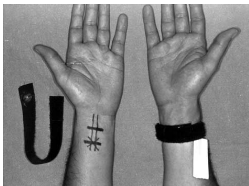
Figure 1. Location of P6 meridian point and the proper application of the acupressure wristband (see methods for details)

The acupressure band was placed around the wrist, in such a way that the patient felt only a gentle pressure without discomfort. To confirm that the compression was not excessive, a pulse oximeter was placed on the index finger to confirm adequate blood flow.