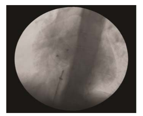
Figure 3. Left anterior oblique view showing the Amplatzer septal occluder was fully deployed and was released by unscrewing

Subsequently, the right catheterization and oximetry run was repeated.