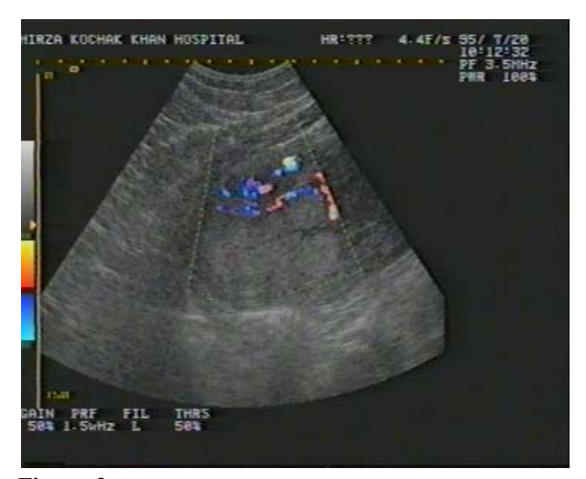
Figure 3. Abnormal blood vessels connecting from placenta to the serosa were seen on color Doppler imaging

Her menstruation returned 6 months after delivery. A scan at 6 months showed complete involution of the uterus.