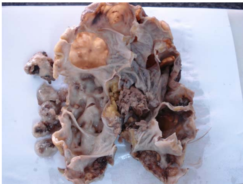
Figure 2. Gross pathology of right kidney

In microscopic evaluation neoplastic mucinous epithelium full of goblet cells was lining the pelvis; papillary projections were frequent up to 2-3 layers. Whole pyelocaliceal surface was covered with neoplastic tissue (Figure 3). No atypia, mitotic forms or pleomorphism was noted in neoplastic cells. There was no stromal invasion. Final diagnosis was made as papillary mucinous cystadenoma of kidney.