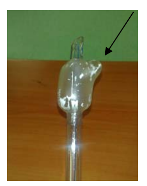
Figure 2. Endotracheal tube cuff herniated to outside

Rigid bronchoscopy illustrated normal tracheobrocheal anatomy, and the thin secretions lying distal to the right bronchus and especially right upper bronchus were suctioned out.