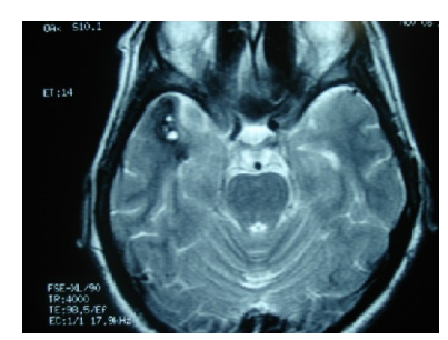
Figure 3. Axial T2 Brain MRI, another angioma in temporal