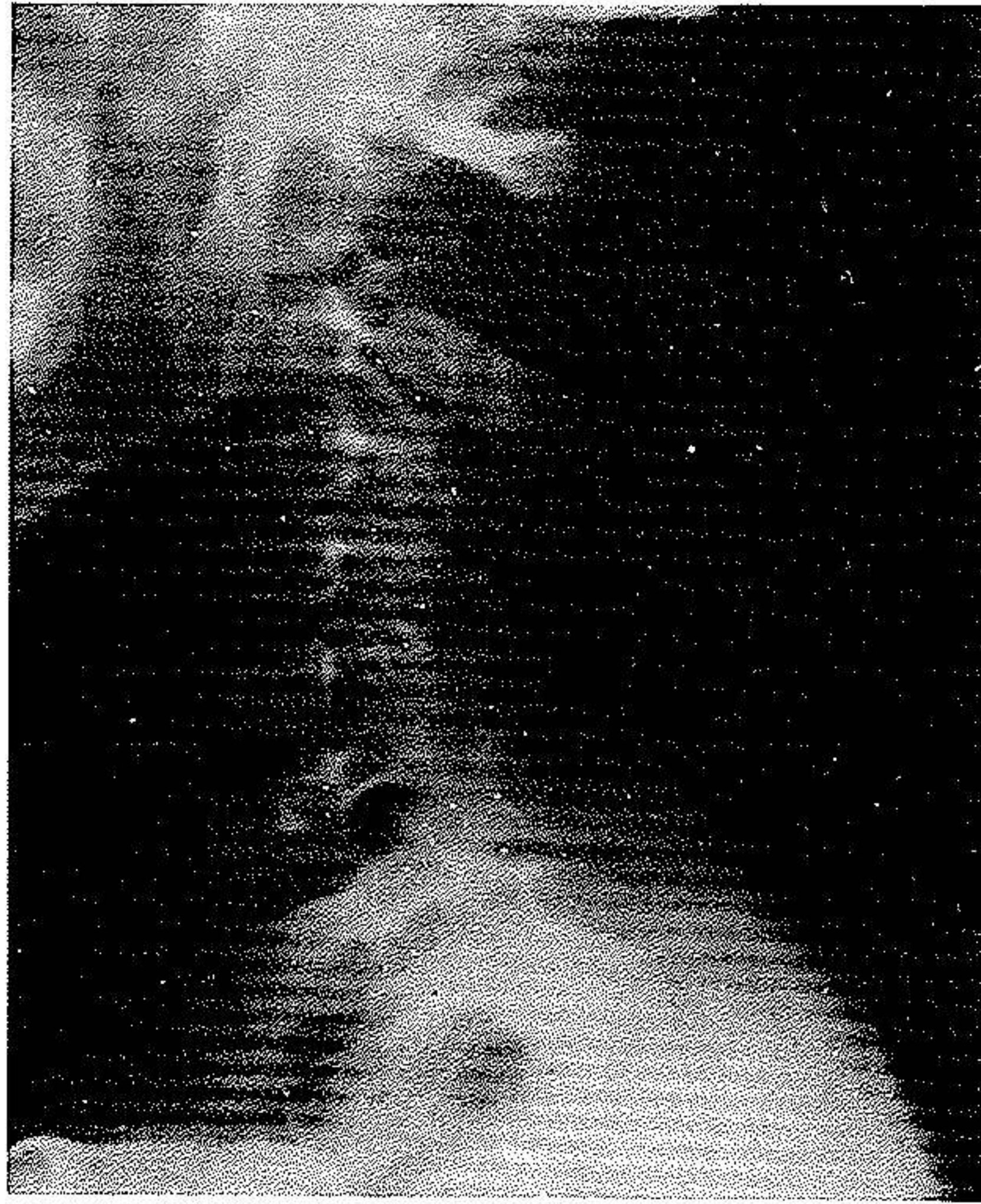
Fig. 1. Aneurysmal bone cyst of C2. There is expansion of the spinous process of C2 with "eggshell" borders.