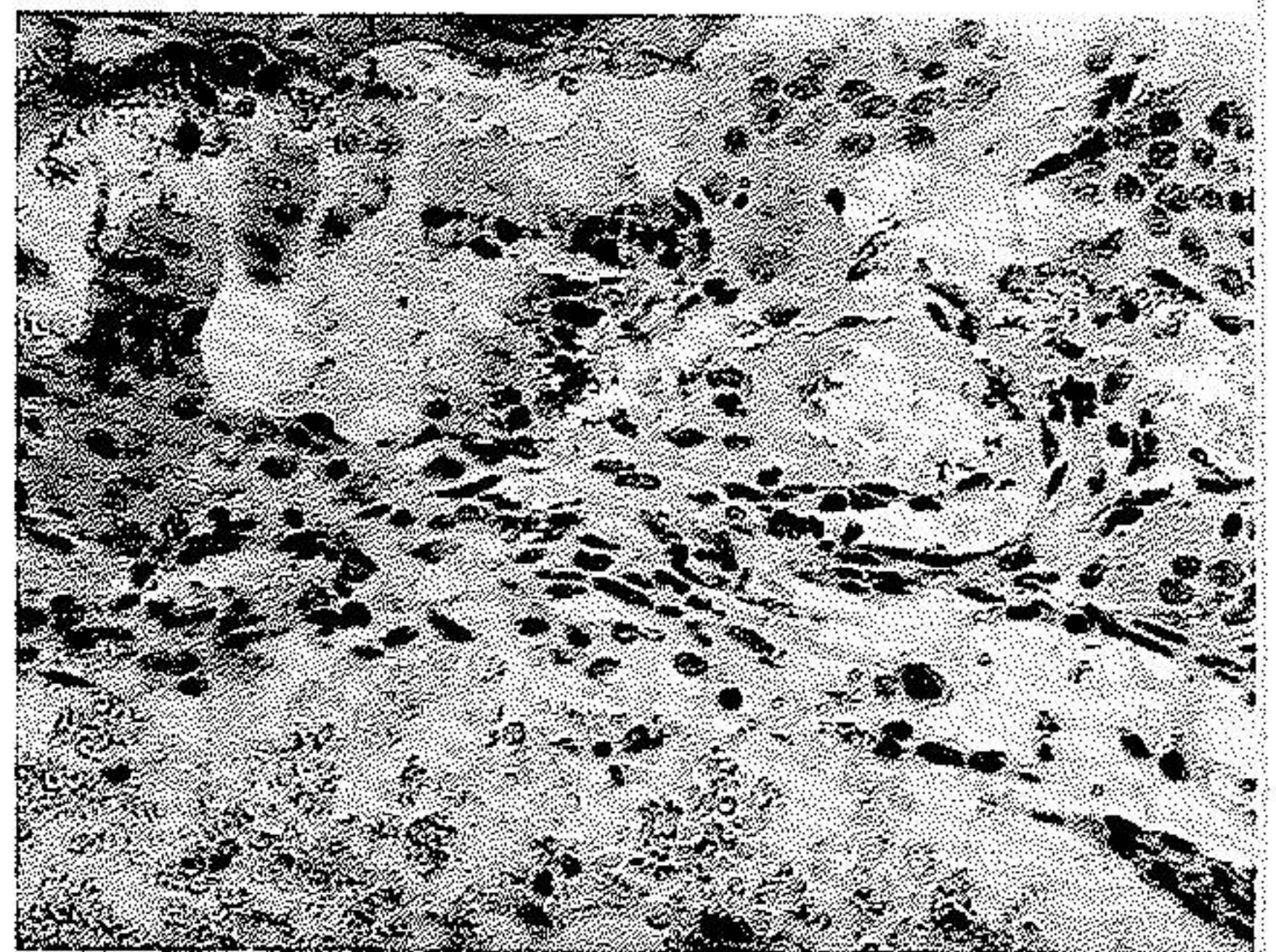
Fig. 2. Typical appearance of an aneurysmal bone cyst with fibrous tissue; septa containing giant cells and hemosiderin is noted. (Dr. Armin. Pathological department, Tehran medical school)