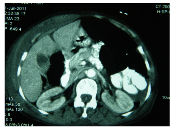
Figure 2. Extension of hematoma to upper abdomen.

Anticoagulant drugs were discontinued and patient was treated with bed rest, intravenous fluids and analgesics. Three days after onset of pain the hematoma showed expansion and marked ecchymosis were noted on overlying skin. Patient developed tachycardia and hemoglobin dropped from 11.9 mg/dl to the level of 10.4 mg/dl and then to 7.9 mg/dl.