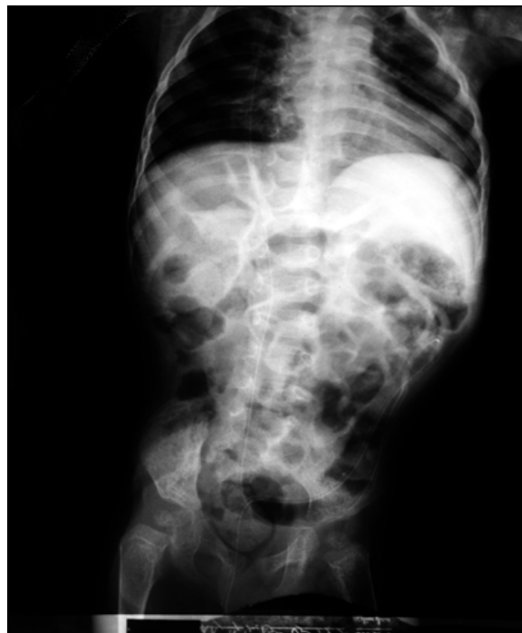
Figure 2. Plain abdominal radiography showing the distal part of the catheter within gastrointestinal (GI) tract.

The catheter was extruded from the anus, because it was protruded through the intestinal lumen without any obvious complications. After extrusion of the catheter, the patient was observed for abdominal signs. No abnormal findings were seen, so a clear liquid diet was started on the 2 nd postoperative day. Finally he was discharged from the hospital on 7 th day after admission.