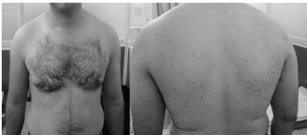
Figure 1. Multiple yellow-brown papules and a few red nodules on the patient's trunk and extremities

treatment has been found effective (4). In some cases, skin lesions were resolved spontaneously (7). Some treatments that have been used for ICH till now include systemic chemotherapy, PUVA, Narrowband Ultraviolet B, thalidomide, pravastatin and low dose methotrexate (1,3,11-13).