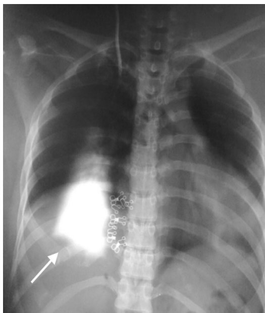
Figure 2. Chest X-ray obtained after dye injection shows dye distribution to the pleural cavity (arrow)

Dye (10cc of Omnipaque®) was injected through each end the catheter and a portable chest X-ray (CXR) was obtained afterwards which demonstrated dye extravasation to the pleural cavity (chest radiography is considered the gold standard for detection of pneumothorax, hemothorax, or cardiac tamponade with injection of contrast media through the central venous catheter (2)). It was concluded that the tip of the catheter had entered the pleural cavity (Figure 2).