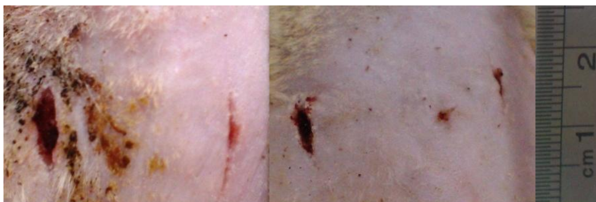
Figure 1. Acceleration of wound closure and healing using tragacanth (right-side wounds) compared to control samples (left-side wounds) in two animals on day 10 after the initial wounding.