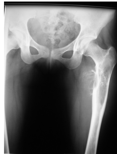
Figure 1. Antero posterior radiograph showed expansile, eccentric lytic lesion in the proximal femur with extension to soft tissue

normal as well. Bone scan showed increased uptake in proximal of left femur. MRI revealed multi-lobulated expansile cystic lesion with fluid and fluid level was suggesting of an ABC of the proximal femur (Figure 2).