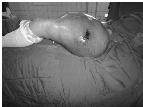
Figure 6. The appearance of the limb just before amputation