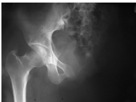
Figure 7. Antero posterior of the pelvis after hemipelvectomy