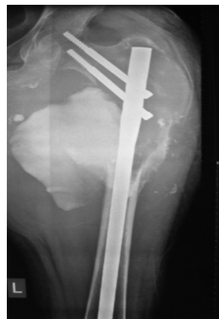
Figure 4. Antero posterior radiograph of the proximal femur revealed progression of the lytic lesion in bone