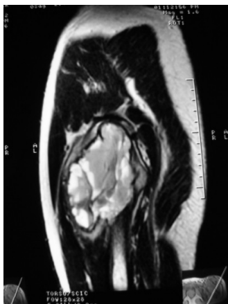
Figure 2. Sagittal T2 weighted MRI of the proximal femur showed multiloculated expansile cystic lesion with fluid and fluid level

the sutured biopsy incision. Hematoma evacuation and homeostasis were done. As an approach to ABC management, cyst curettage and fixation with intramedullary nailing was done. Six months later patient returned to the clinic because of increasing pain, recurrent swelling of the proximal of her left thigh and limping. Radiography of the left hip and proximal femur revealed a lytic lesion of the proximal femur and soft tissue swelling (Figure 3). She underwent the curettage and cementing without exchanging the device. Three months after the second procedure, patient had intense pain in her thigh and radiography of left hip showed progression of the lesion (Figure 4). At this time patient, had serosanguineous discharge from the previous incisional scar. To control swelling and suppression of the lytic lesion, intra-arterial embolization was done which failed to control the progression of the diseases. Six months later she received 15 courses of fractionated radiotherapy (total dose 3000 rad), which did not help her.