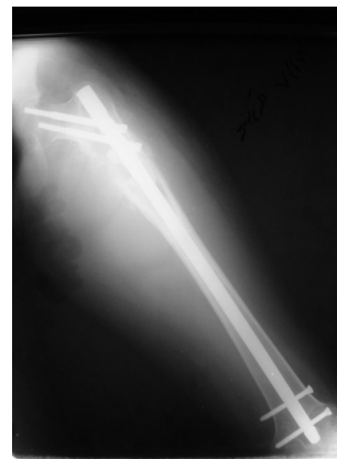
Figure 3. Anteroposterior radiograph of the entire femur 6 months after curettage and cephalo- medullary nail fixation showed a lytic lesion and soft tissue swelling in the sub trochanteric area

The patient was followed up every 3 months and her disease progressed. Radiography showed local recurrence; the cement had been extruded, and the fixation had failed. One year after completion of radiation therapy, the proximal femur had been resorbed completely. A massive hematoma remained in place (Figure 5). The patient was suffering from a large mass, chronic wound bleeding and pain (Figure 6). A hemipelvectomy was the only remaining option and was carried out after consultation (Figure 7). After the hemipelvectomy, histological examination showed a hemorrhagic tissue with cavernous spaces separated by a cellular stroma again with a definite diagnosis of ABC (Figure 8). Two years after the hemipelvectomy there has been neither local recurrence nor distant metastasis. A written consent was obtained from the patient to report this case).