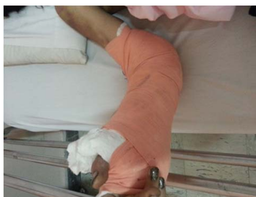
Figure 4. The right radius was fractured