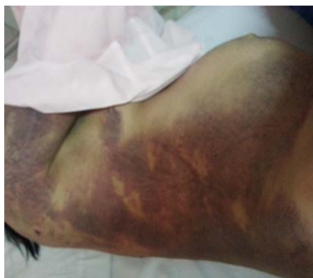
Figure 2. Multiple ecchymosis on the abdomen and front of the torso

There was hemorrhage in the eyes. There was a hematoma on the left ear with auricle deformation (Figure 3).