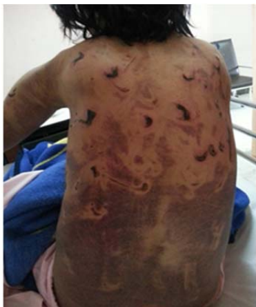
Figure 1. Multiple ecchymosis and lacerations on the back of the torso

her with a power cable after abusing methamphetamine. There. Multiple ecchymoses and lacerations were present on the front and back of the torso, abdomen, and extremities (Figures 1,2).