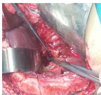
Figure 3. Hydatid cyst communicating with bile duct