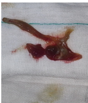
Figure 5. Daughter cyst and debris