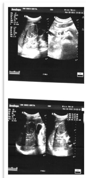
Figure 1. Ultrasound images showed liver hydatid cyst and dilated CBD.

cyst blocking the CBD. About 5 days after initial therapy, surgical intervention was performed. Surgical exploration showed a 5*5 cm hydatid cyst in a fifth and sixth segment of liver and dilated CBD. At first cholecystectomy was performed and hydatid cyst unroofed. There was a communicating fistula between cyst and intrahepatic duct at the base of the cyst that it was closed with suturing (Figure 3). Choledochotomy was performed, and daughter cyst and debris was extracted (Figure 4,5). Intraoperative cholangiography (IOC) revealed stenosis of Oddi then choledochoduodenostomy was performed. After surgical intervention, the patient was free of symptoms with only slightly increased cholestasis enzymes.