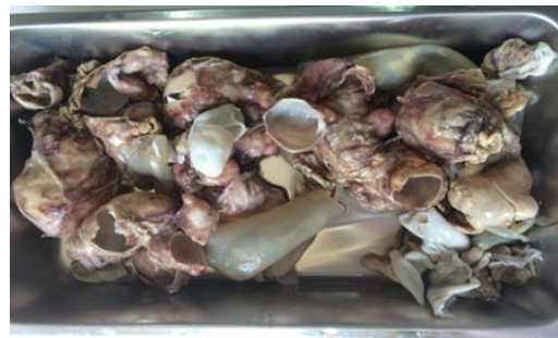
Figure 1. Multiple hydatid cysts removed by surgical excision from abdominal and pelvic cavities and related organs in a 14-year-old girl

After exploratory laparotomy, we found multiple cysts (over 50) with the different sizes in her ovaries, pelvic cavity (over 20 cysts), peritoneum, mesentery, omentum, and a cyst in the left lobe and 3 in the right lobe of liver with invasion to the diaphragm (Figure 1).