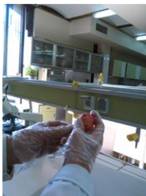
Figure 2. A large cyst removed from omentum. This cyst was fertile, contained thousands of protoscolecemes

vegetable without washing frequently, when her mother was cleaning the vegetables, and performing resuscitation for a newly expired puppy by mouth-to-mouth breathing! The patient released from the hospital after surgery and removing various cysts from pelvic and abdominal cavities, with the good general condition. We diagnosed this case as a primary disseminated hydatidosis.