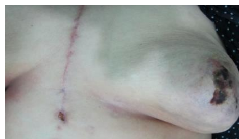
Figure 3. Left breast necrosis