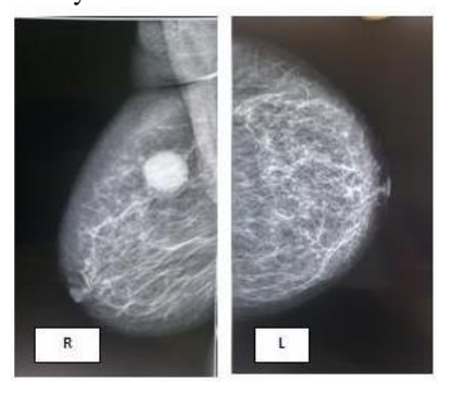
Figure 1. Mammography showed a 30 mm high-density mass with an ill-defined border in the right breast, and the left breast was unremarkable

tissue. Microscopically the tumor composed of the neoplastic plasma cells with a great content of cytoplasm and eccentric nuclei (Figure 2).