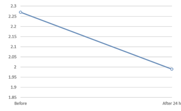
Figure 1. The mean of the pulsatility index in the fetal middle cerebral artery before and after 24 hours of receiving progesterone

The mean gestational age of the study population was 28.8\pm2.9 weeks, ranging from 23 to 32 weeks gestation. Mean change of MCA-PI was 1.99 in patients with preterm labor after 24 h of treatment (Figure 1, P =0.372), Mean change of MCA-PSV (cm/s) was 43.53 in patients with preterm labor after 24 h of treatment (Figure 2, P =0.568).