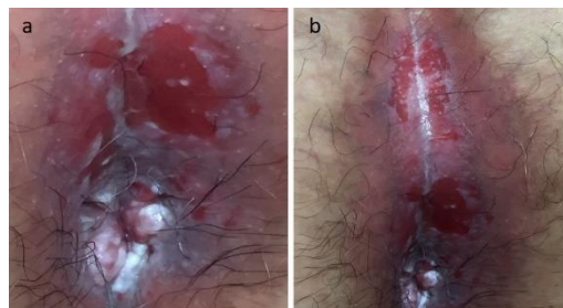
Figure 1. Clinical appearances of the lesions before treatment. a) Perianal vegetative lesion surrounded with erosions; b) Diffused inflammatory macerated erosions in the intergluteal cleft

and adjacent to the perianal lesion (Figure 1). Regional lymph nodes were not enlarged, and other systemic examinations were all normal. The complete blood counts, serum biochemistry, and ESR were all within the normal limits. There was also no proteinuria.