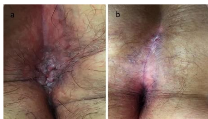
Figure 3. Clinical appearances of the lesions after the last session of treatment. a) Perianal area; b) intergluteal cleft